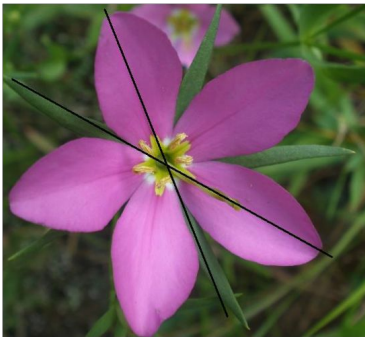
This flower has 5 lines of symmetry.

REAL LIFE EXAMPLES~ REFLECTION IN WATER;SOME PLANTS;FOOD;LOGOS;LETTERS